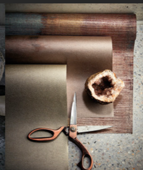
A selection from Definition