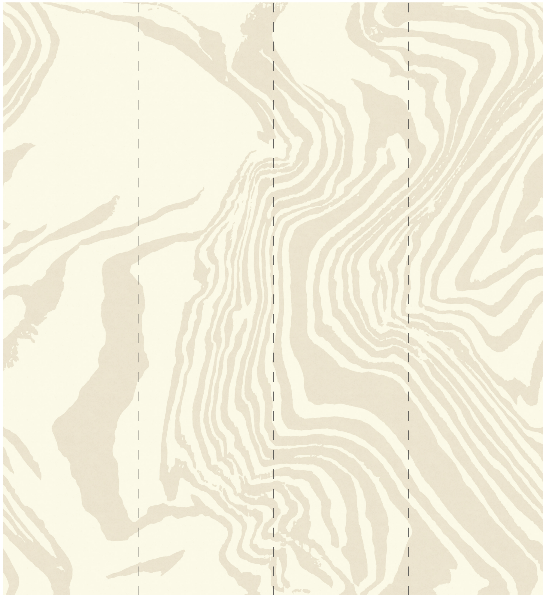
MARBLE - OATMEAL 113185 AS APPLIED TO WALL - 274cm (Total Width) x 300cm (Height)